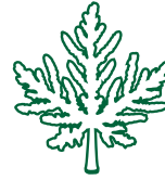
— evergreen tree — Represents the richness of nature, resilience, and longevity